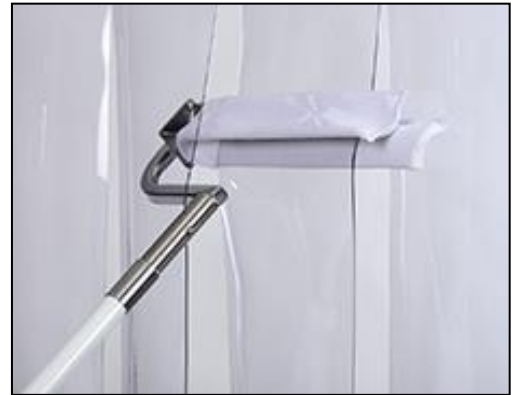
DualClean Softwall Strip Cleaner and curtain strip path